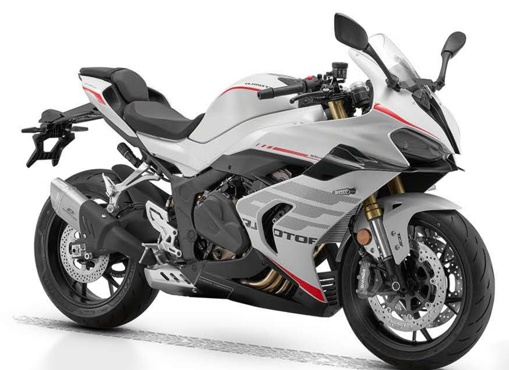
SEA SALT WHITE